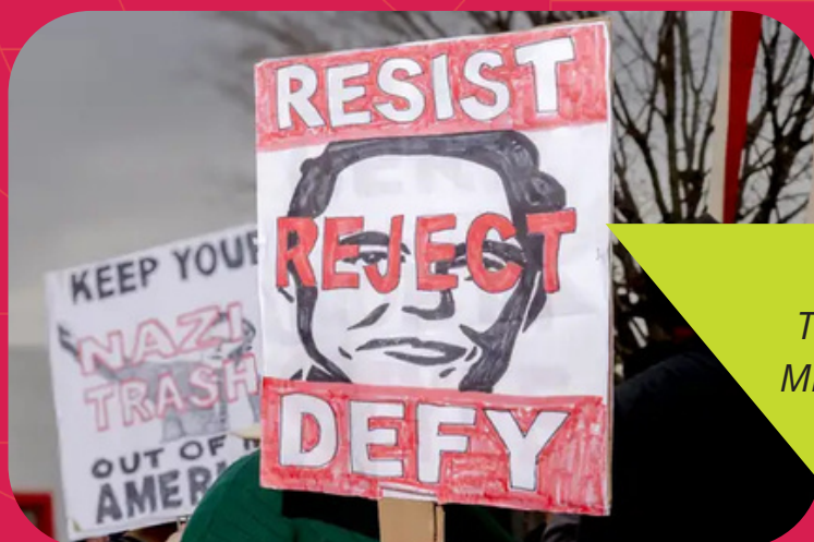
Tesla Takedown protesters in Michigan.